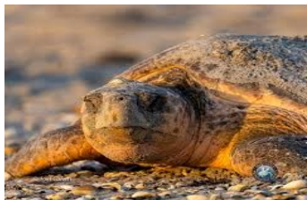
Mama Turtle on the nest

In 1978, the Florida leatherbacks and loggerheads were added to the endangered species list and Floridians stepped up their protection game, resulting in an astonishing increase in nests and hatchlings. By 2023, the number of nests had increased to 133,840 shattering all previous records.