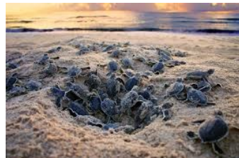
Hatchlings going for it