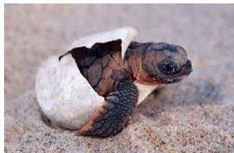
Baby making an entrance